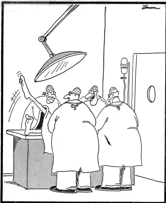
"Whoa! That was a good one! Try it, Hobbs — just poke his brain right where my finger is."